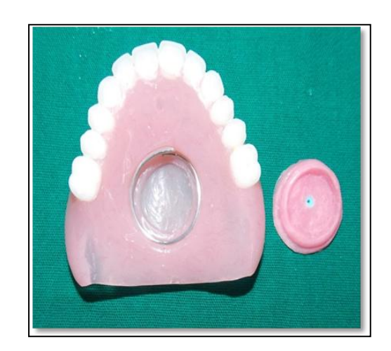
FIG. 5 FIG. 6