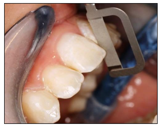
Fig. 3. "Ortho-strip" with a holder

D-Ortho-strips- These are thin, semi-flexible strips used with a holder (Figure 3). Intensive Proxo shapes are flexible thin blades that removes a small amount of the intermolar enamel to provide banding space if separation has not been effective. This technique requires more time than ARS, but the results obtained are more predictable, and the enamel surface obtained is smoother than that achieved when using burs