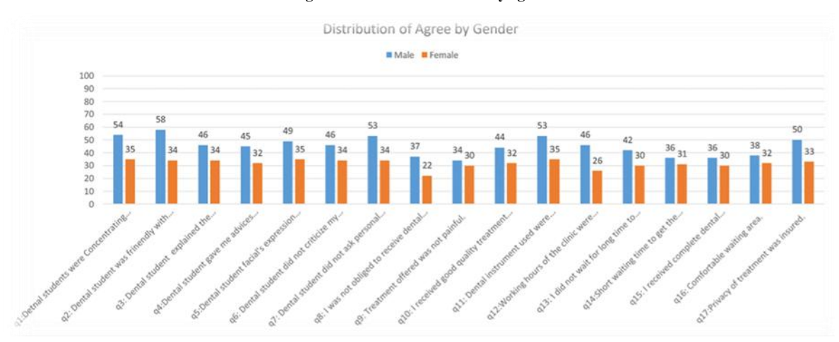
Figure 2. Distribution of agree by gender