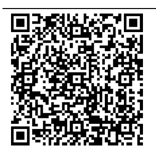
Keywords: Patient satisfaction, Dental student, Dental care