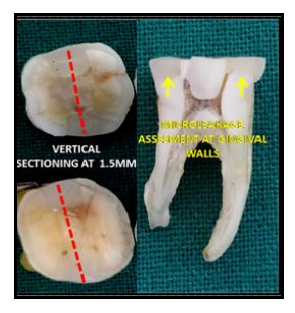
Figure 3 : Vertical Sectioning Of The Tooth Samples