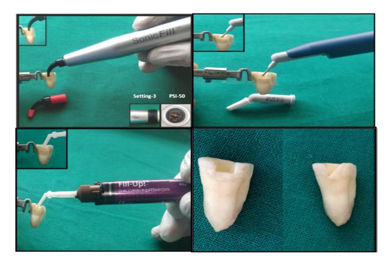
Figure 2: Restoring The Cavity Using A) Sonic Fill B) Sdr C) Fillup D) Filtek Z350