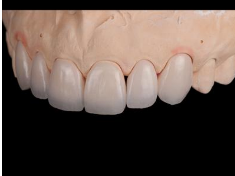
Feldspathic porcelain veneers