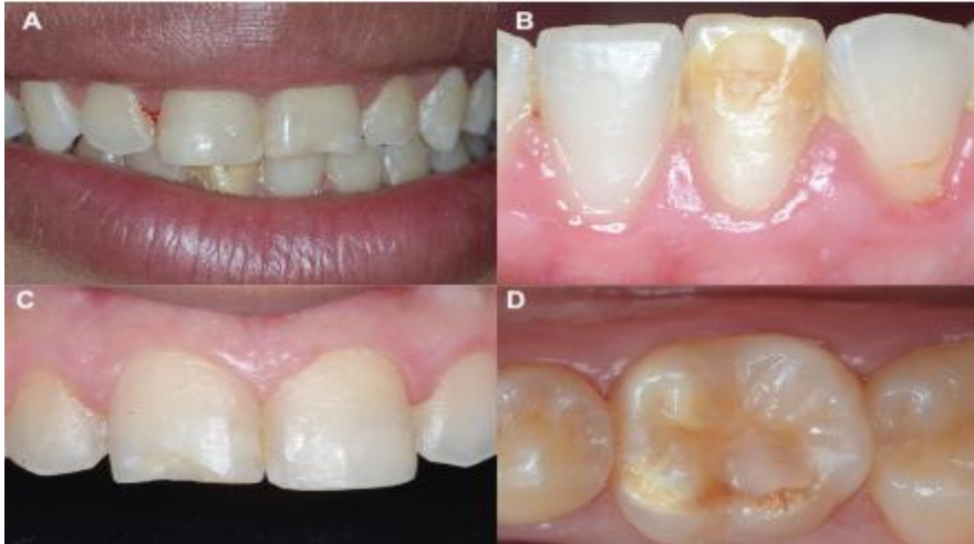
A: The initial appearance of patient;