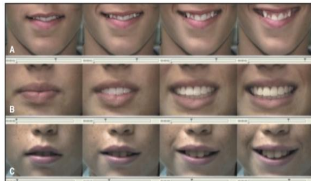
Three smile styles: A. Cuspid B. Complex C. Mona Lisa Fig.2