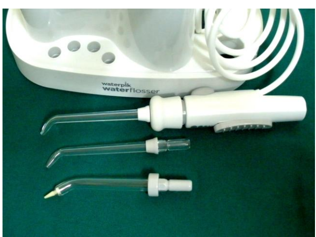
Figure 2: Water Flosser with Different type of Tips