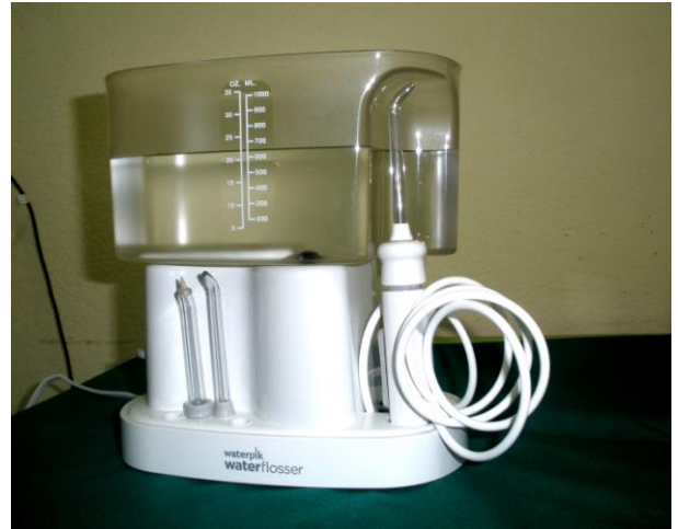
Figure 1: Water Flosser Used for the Study

instructed to finish one container of 500 ml at each visit.