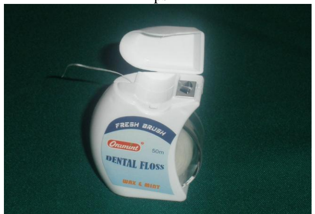
Figure 3: Standard Dental Floss Used for this Study

Subjects in the B group (DF) used standard waxed dental floss once a day in the evening. At the baseline visit (First visit), immediately following the baseline assessment, subjects used their allocated product for the first time. Clinical assessment<sup>11</sup>