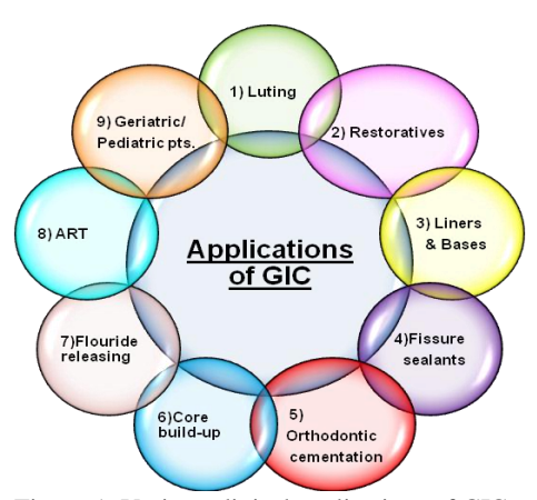
Figure-1: Various clinical applications of GIC

material should i) be biocompatible, ii) bond permanently to tooth structure or bone, iii) match the natural appearance of tooth structure and other visible tissues, iv) exhibit properties similar to those of tooth enamel, dentin and other tissues, vi) be capable of initiating tissue repair or regeneration of missing or damaged tissues. <sup>[1]</sup>