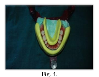
Try in of denture and after trial adaptation of 26 gauge wire over the central fossae of mandibular posterior teeth

canine & extending posteriorly to the lingual and buccal aspects of the retro molar pad. This area is called Pound's triangle<sup>7,10,11,12,13,16</sup>. The Neutrocentric concept requires that posterior mandibular denture teeth be arranged to occupy as central, a location as possible, relative to denture foundation, without disturbing the tongue function<sup>14</sup>. Lammie argued that in ageing patients, mandibular posterior denture teeth should be arranged over the buccal shelf to provide increased tongue space and to facilitate the development of vertical facial denture polished surfaces, against which an effective facial seal can be achieved and maintained<sup>15</sup>.