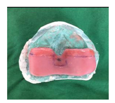
Fig. 6: Custom tray