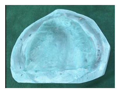
Fig. 14: Master Cast obtained after Refining the Borders