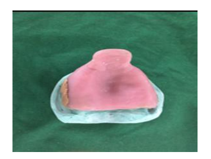
Fig. 12: Primary cast with special tray