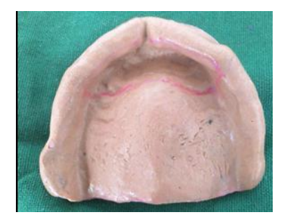
Fig. 13: Impression made over primary cast