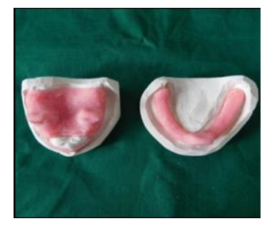
Fig. 16: Custom trays with windows