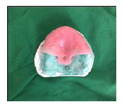
Fig. 7: Pickup tray