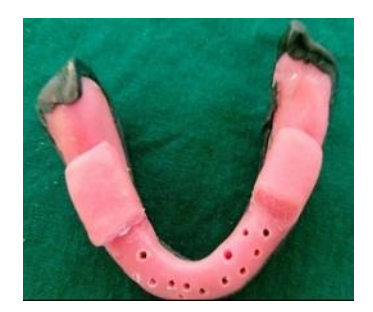
Fig. 4: Perforations done on special tray which covers flabby areas