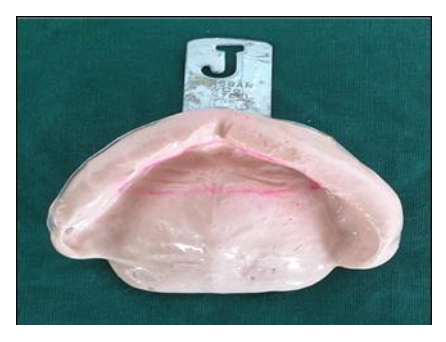
Fig. 11: Mucostatic Alginate impression