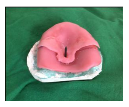
Fig. 8: Locating rod placed during fabrication