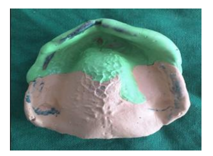
Fig. 9: Final impression made with ZOE and PVS light body