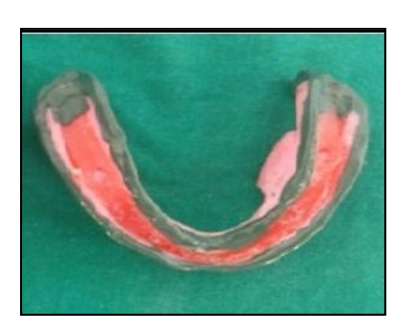
Fig. 3: Border molding done