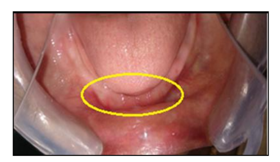
Fig. 1: Intra oral view